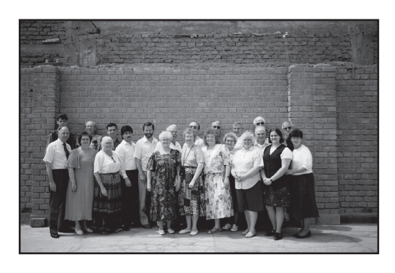
(One of the Work & Witness teams that worked on the Peru Seminary buildings.)

without the help of Work & Witness teams. Preference in assigning projects for this assistance is usually given to district centers, parsonages, and offices, and often to an important ministry center, or even first church, in a developing mission area. As mentioned before, the Work & Witness teams that have gone to the jungle areas have fulfilled an important role in encouraging the formation of strong churches as well as giving an unforgettable mission experience to the team members.