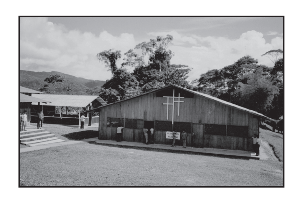
(New Horizons mission station, Bible Institute and tabernacle.)

After 2003, the road from Bagua to Imaza was paved, and the entire trip from Chiclayo to New Horizons could be made in one day. In recent years, additional roads have been built in this jungle area that have made it possible to travel overland to the towns of Nieva [nee–E–vah] and Saramiriza [sah–rah–mee–REE–sah] on the lower Marañón River. These roads cross over very rugged terrain and mountains and require constant maintenance to keep them usable. While most of the Aguaruna and Huambiza communities are located along the Marañón, Cenepa, and Santiago Rivers, as well as small tributaries, it still has given greater opportunity to the Aguaruna and Huambiza peoples to connect with the outside world. They are also able to use modern communications such as cell phones and internet.