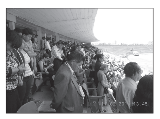
(Stadium crowd at closing service of Centennial Celebration.)

Church planting has continued throughout Peru. By 2018 there were 806 organized churches and 184 missions, for a total of 990 churches. The 16 districts reported a total of 56,058 full members, plus 15,553 "fellowship members." The fellowship members are receiving discipleship and membership training before being received into full membership. These are the fruits of evangelism. The mountainous Central and Southern Andes areas present the most difficult areas for evangelism and church planting. There are cultural and language challenges, as well as strong religious and animistic traditions in these areas. The districts reporting the greatest growth in the 2018 year are the Central District with 871 conversions, the North District with 1,485 conversions,