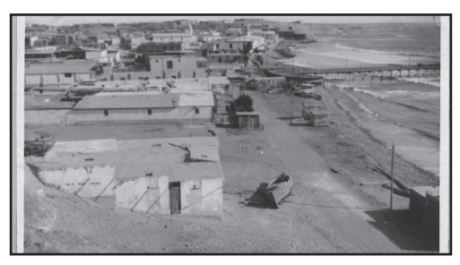
(The pier where the Winanses landed in Pacasmayo on 1 November, 1919)

almost no money. We were placed in a hotel for the night, and the next morning before breakfast, a boy from the hotel was knocking on our door and demanding pay for our night's lodging. We were definitely up against it.